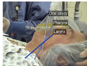
Figure 2. The "sniffing" position

In many cases, a neuromuscular-blocking agent and a potent sedative are needed to facilitate intubation. These agents will improve your visualization of the vocal cords and prevent the patient from vomiting and aspirating gastric contents. 3 If you plan